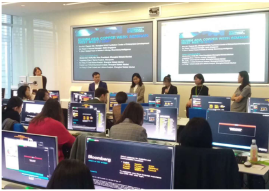
SMM Panel discussion with the theme of “West Meets East”